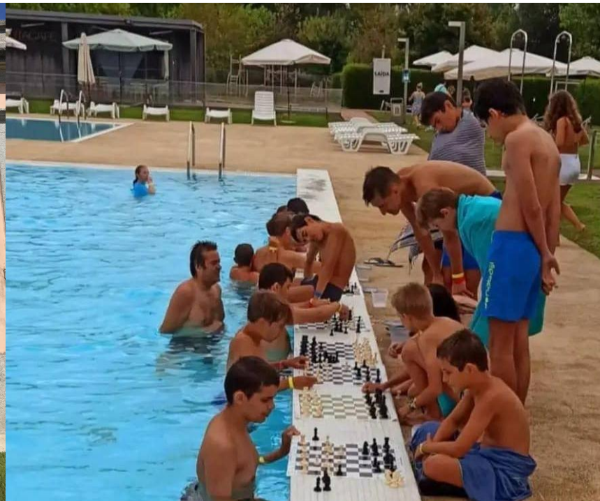
Chess for families