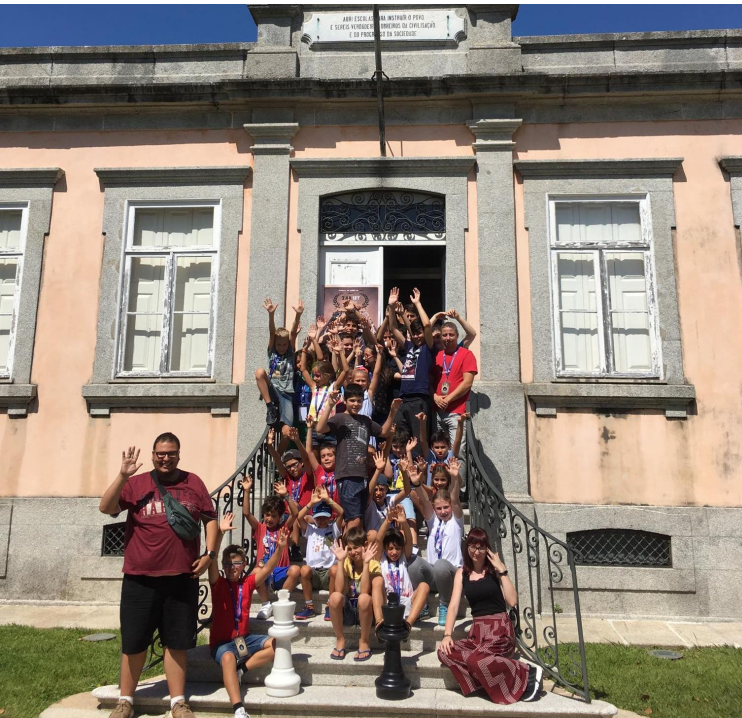
Chess in summer camp